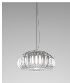
DIAMA SP G