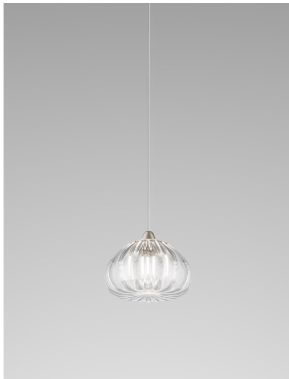
DIAMA SP P CR NI G9 CE